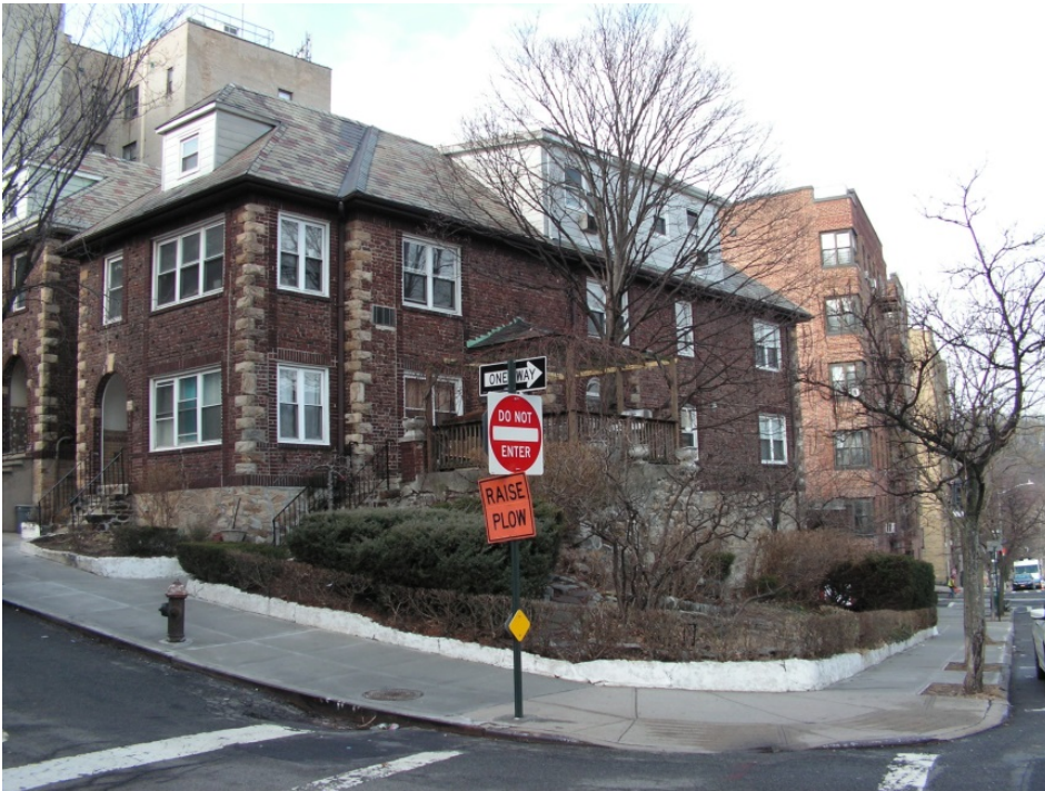
95 Park Terrace West LPC Staff, February, 2018