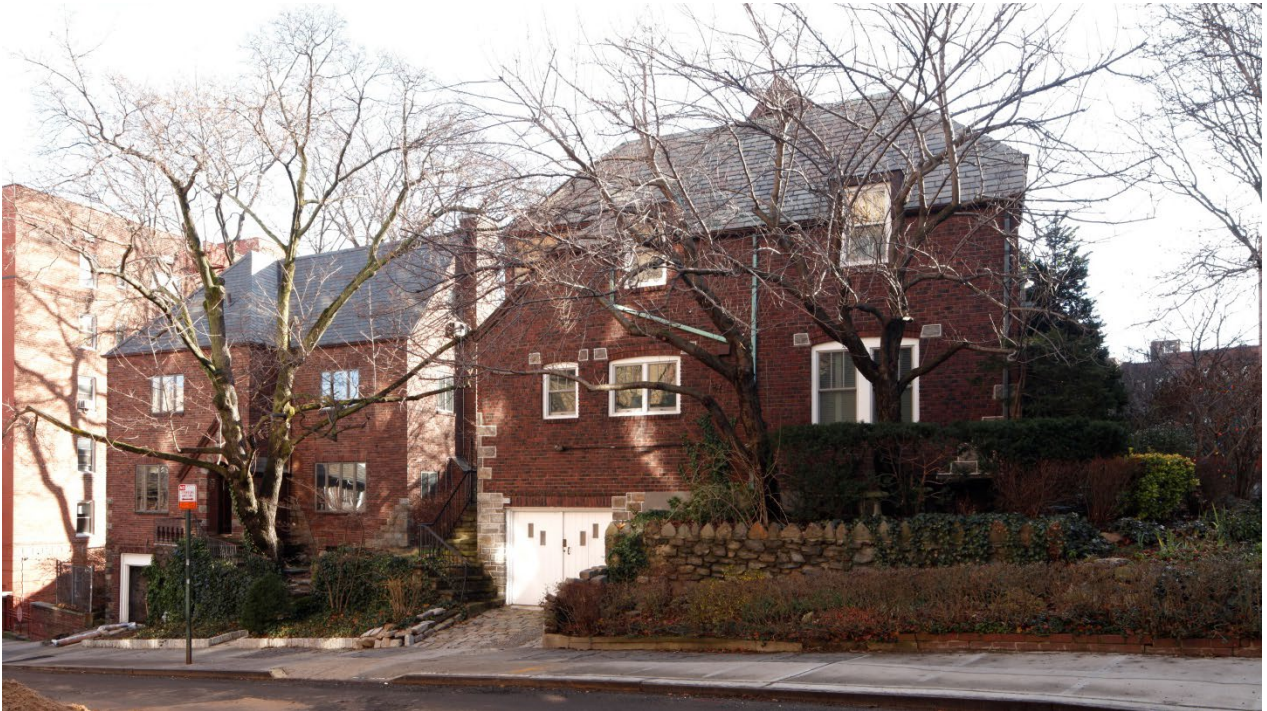
96 Park Terrace West (left) and 545 West 217th Street (right) LPC Staff, December 2018