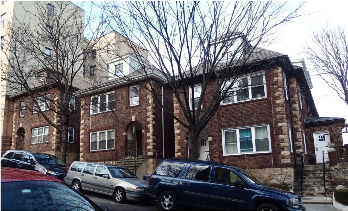
91, 93, and 95 Park Terrace West LPC Staff, February 2018