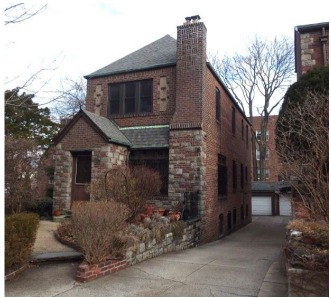
537 West 217th Street (above) 539 West 217th Street (upper right) 535 West 217th Street (lower right) LPC Staff, February, 2018