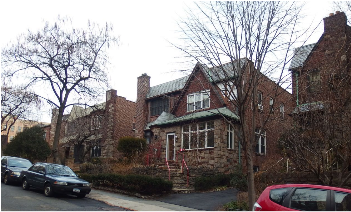
535 to 527 West 217 th Street (left to right) LPC Staff, February 2018