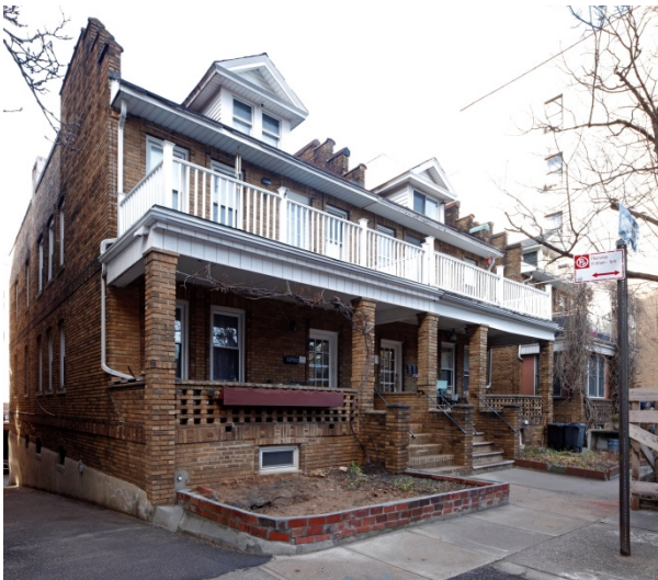
77, 79, and 81 Park Terrace West (below) LPC Staff, December 2018