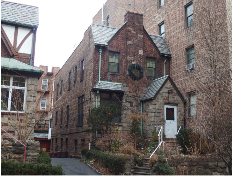
527 West 217th Street LPC Staff, February, 2018