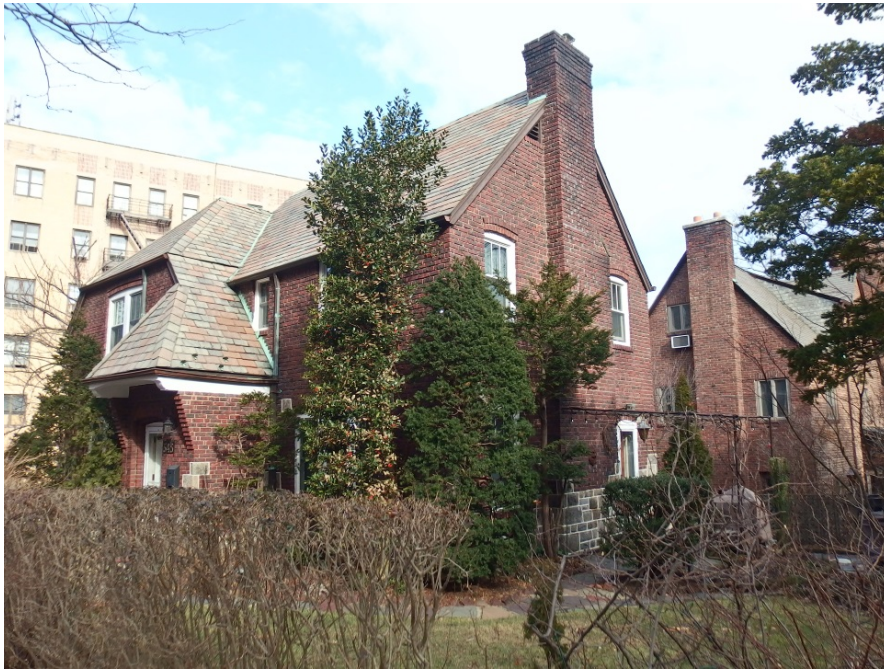
545 West 217th Street LPC Staff, February, 2018