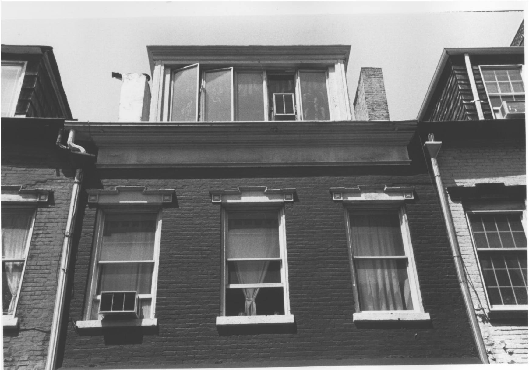
129 MacDougal Street House, upper section