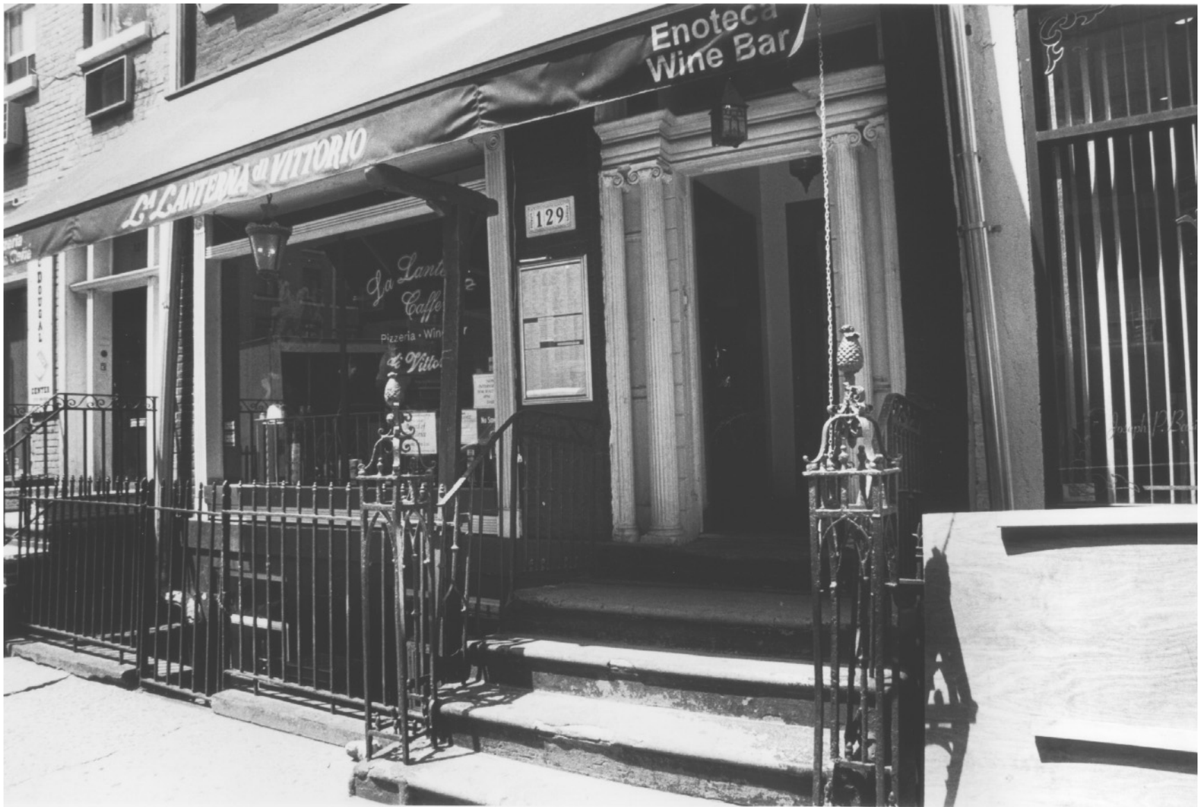
127 MacDougal Street House, first story