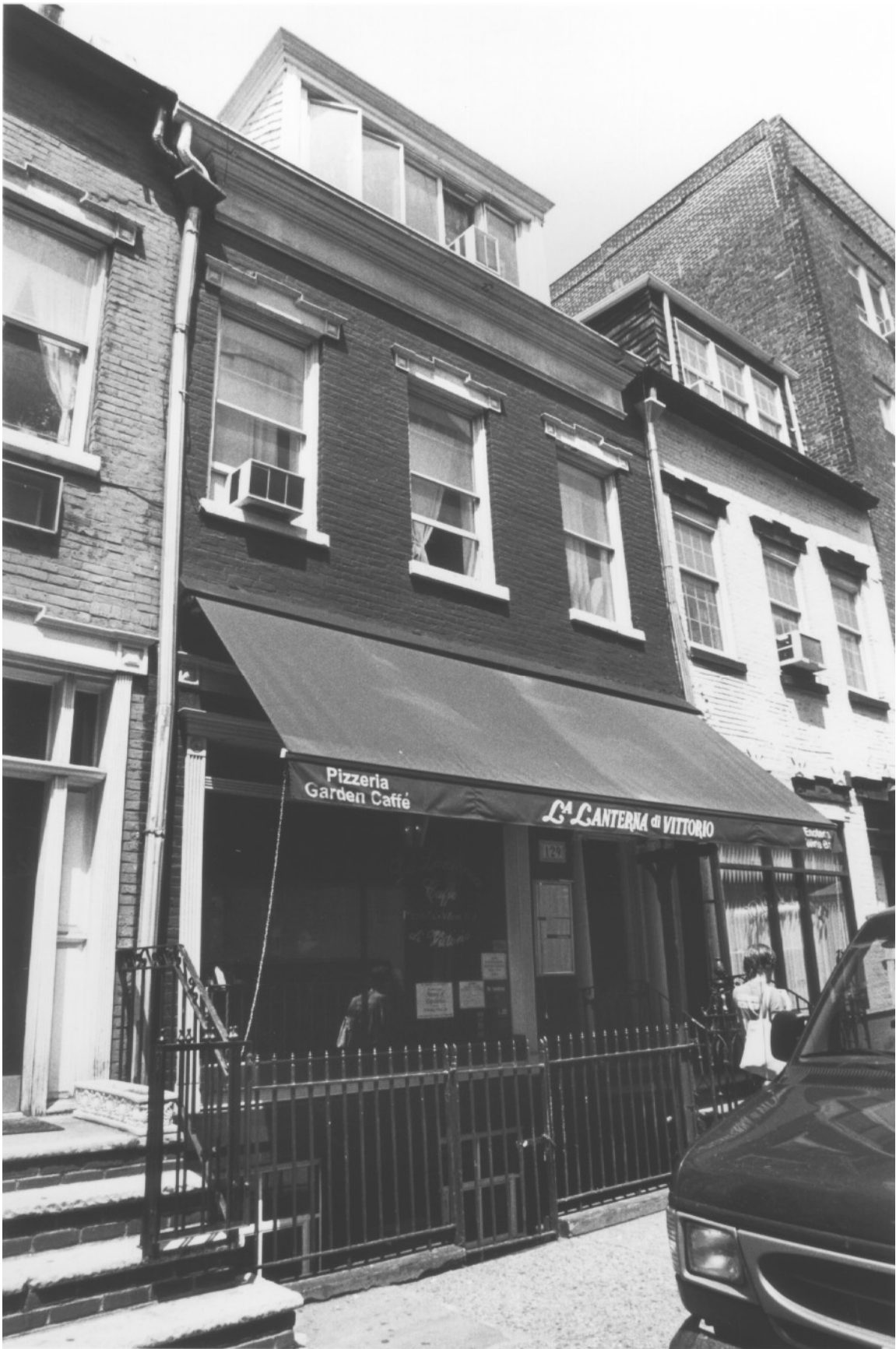
129 MacDougal Street House