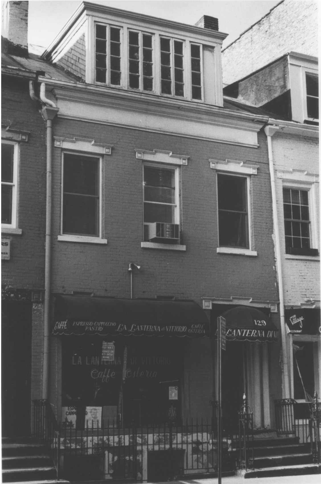
129 MacDougal Street House