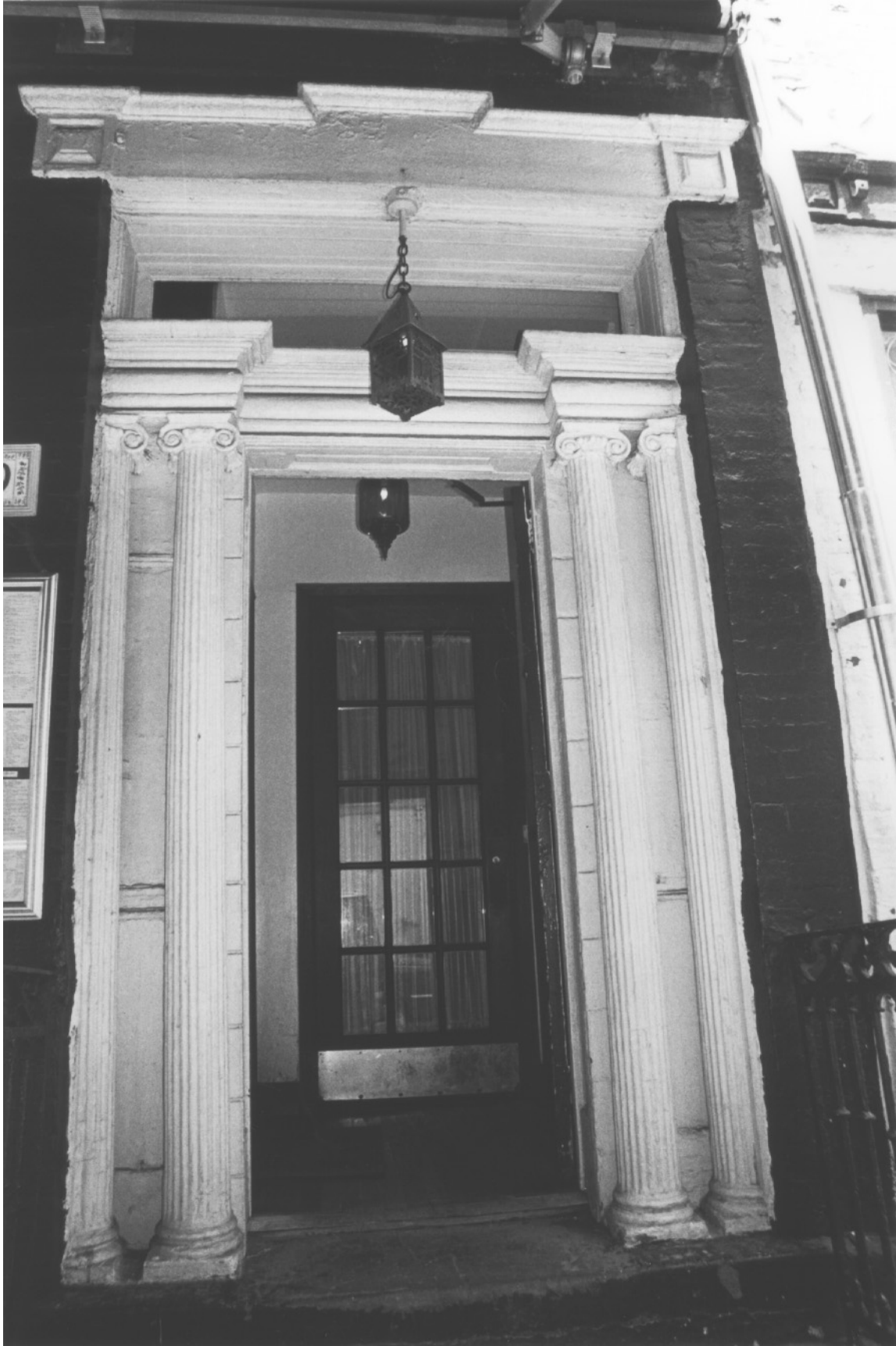
129 MacDougal Street House, entrance