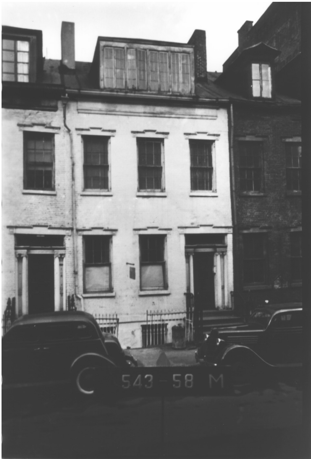
129 MacDougal Street House