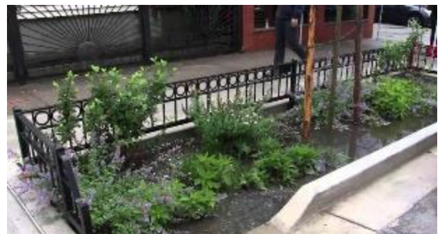
Curbside Rain Garden (Bioswale)

DEP has initially focused primarily on the Area-wide right-of-way contracts building curbside rain gardens, Stormwater Greenstreets, and porous paving. DEP's standardized designs and procedures have been critical to supporting the systematic implementation of green infrastructure at a wide scale. DEP expects to continue green infrastructure implementation using an expanding array of tools. As right-of-way implementation continues and reaches its fullest extent over the long term, DEP will increasingly rely on other, more site-specific opportunities on public and private property. Over time, the proportion