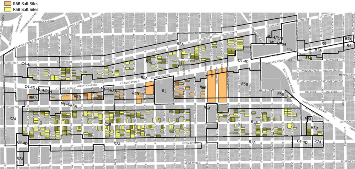
Brooklyn Borough President's Office Analysis of Potential Soft Sites

One means to reduce the number of potential redevelopment sites is to reduce the amount of permitted zoning floor area. This would be accomplished through a zoning map change designation, which results in less floor area than the proposed R5B and R6B, and the adjacent R4 and R5 designated areas.