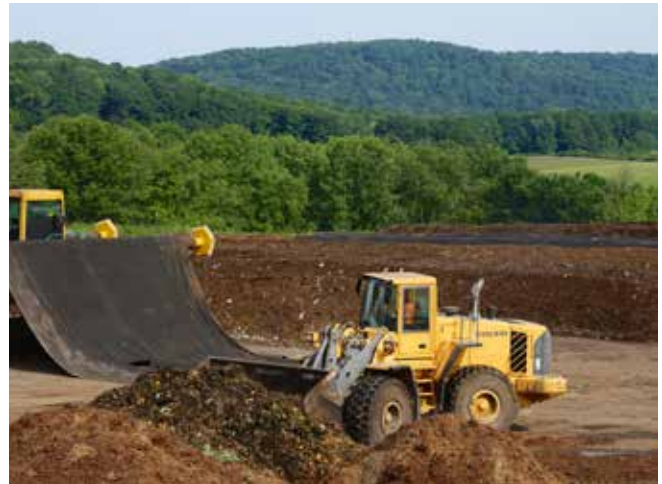
McEnroe Farm converts food scraps and yard waste to a high quality soil amendment in the form of compost.