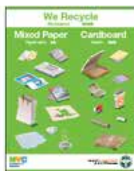
Mixed paper and cardboard poster