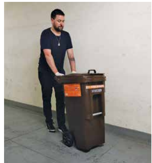
Set food scraps bins at the curb after 2 pm, but before 4 pm, every weekday.