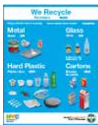
Metal, glass, plastic, and cartons poster