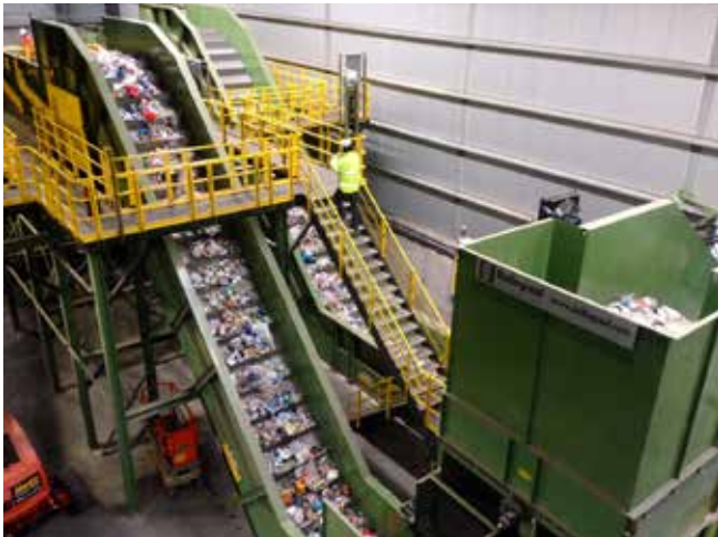
Sims Municipal Recycling processes NYC's residential and school recycling.

To find field trip ideas for students, visit: on.nyc.gov/dsny-field-trips .