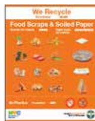
Food scraps and food-soiled paper poster