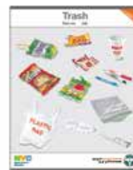
Trash landfill poster for schools with NYC Organics Collection