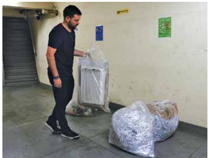
Keep bags of recyclables and trash in separate piles.