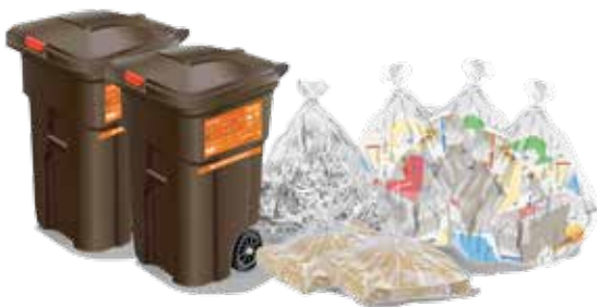
Mon, Wed, Fri: Set out brown food scraps bins and clean paper & cardboard recycling.