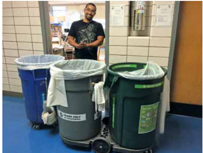
Dual-bin dolly recyclables and trash in separate piles.

To order FREE decals, signs, and posters, visit: on.nyc.gov/recycling-materials .