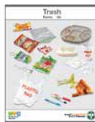
Trash landfill poster for schools without NYC Organics Collection