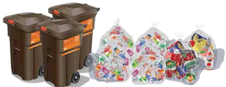
Tue, Thu: Set out brown food scraps bins and bags of metal, glass, plastic, and cartons .

Comply with set-out regulations for each material stream in accordance with the Department of Sanitation’s collection schedule. Schools with Organics collection can find their customized set out schedule by visiting: on.nyc.gov/school-sustainability .