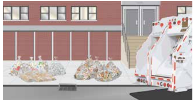
Set out trash and recyclables in distinct piles on the correct day.

Dumpsters: Some large schools may use separate dumpsters for trash and clean paper & cardboard . However, metal, glass, plastic, and cartons are always collected curbside in clear bags.