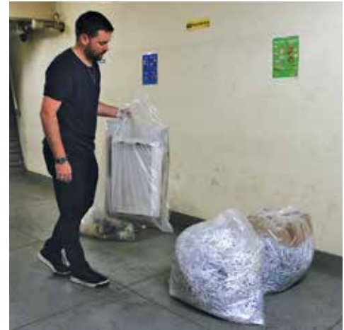
Store clean paper & cardboard, metal, glass, plastic, and cartons, and trash in three separate piles.