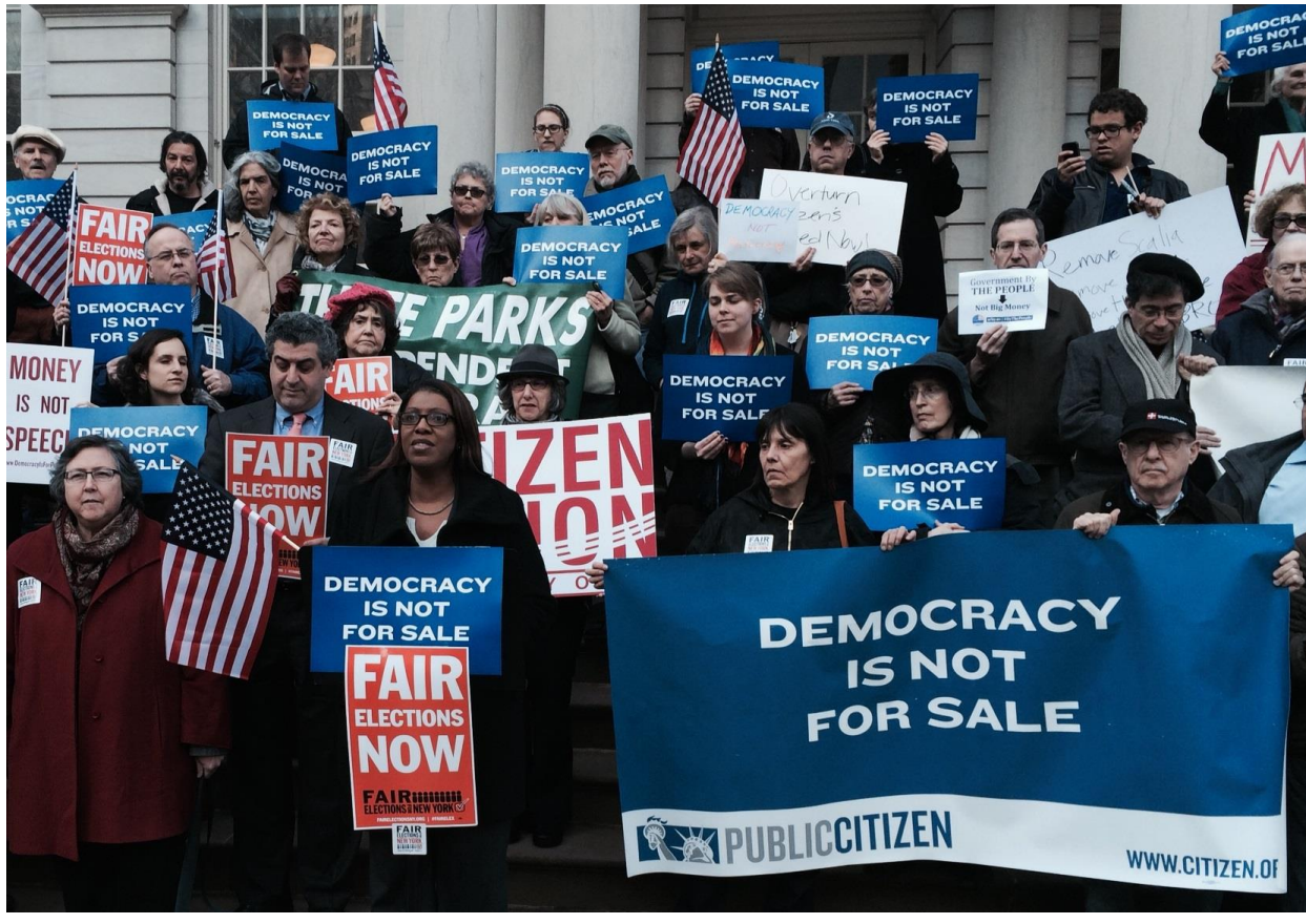
Public Advocate James rallies with advocates for ending the influence of big money in elections, following another Supreme Court ruling (McCutcheon v FEC) that erodes limits to political donations.