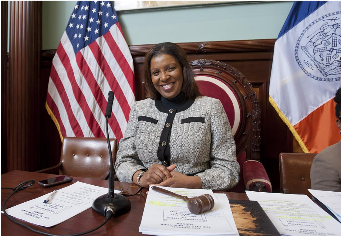
Public Advocate James presides over the City Council as Speaker Pro Tem. PA James has expanded the legislative role of the Public Advocate's office.