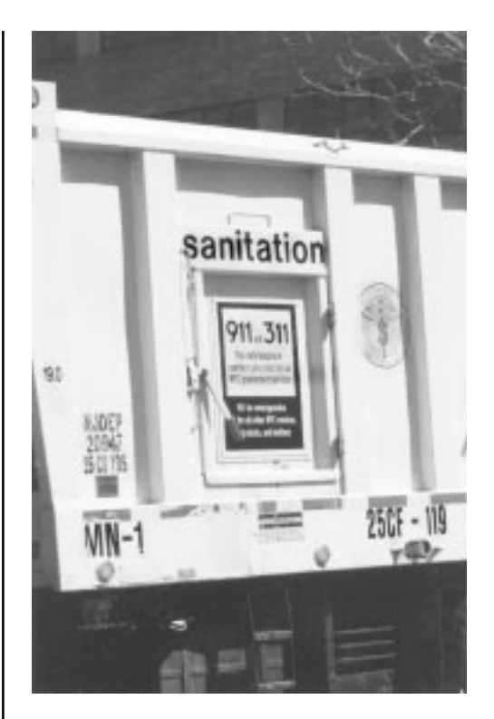
311 Goes Citywide

"Take Our Children to Work" day is an opportunity for youngsters to learn how our City works. Sanitation's program was organized by the Department's Women's Advisors Program, who also served as chaperones.