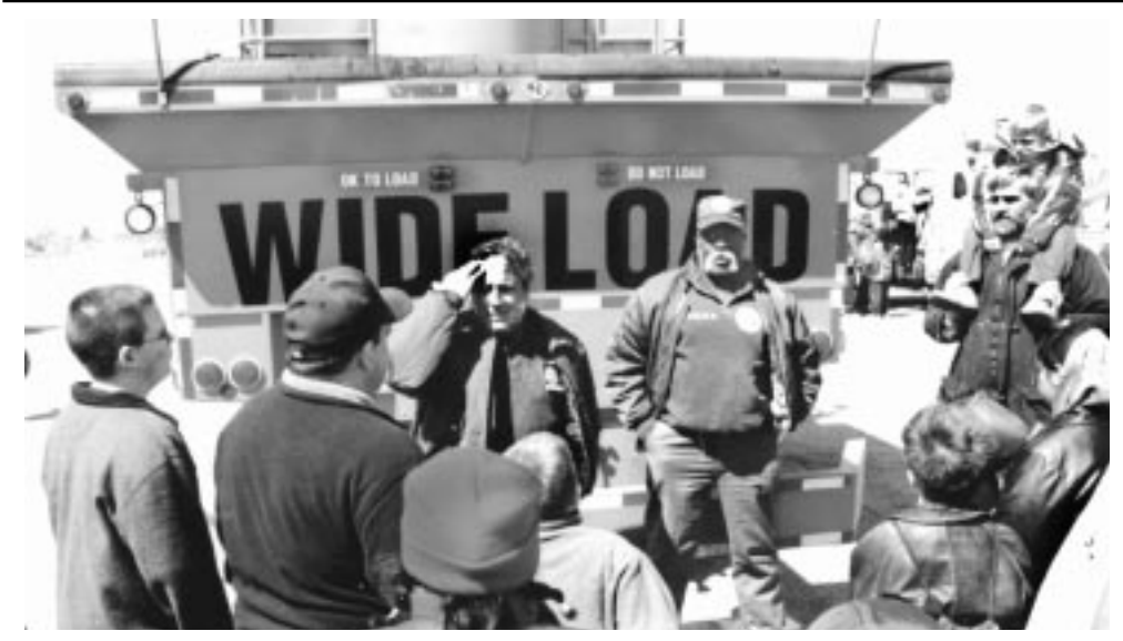
Sanitation Employees' Children Join In 'Take Our Children to Work' Day

Nearly 100 children of DSNY employees participated in the second annual "Take Our Children to Work" day hosted by the Department's equipment training center at Floyd Bennett Field in Brooklyn.