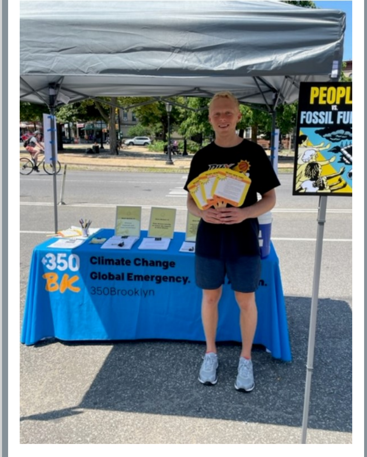
Thanks to 350 Brooklyn for sharing our extreme heat preparedness tips at their event this weekend!