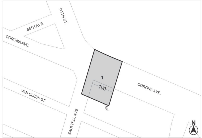
Mandatory Inclusionary Housing Area see Section 23-154(d)(3)

Area 1 — [date of adoption] — MIH Program Option 1 and Option 2