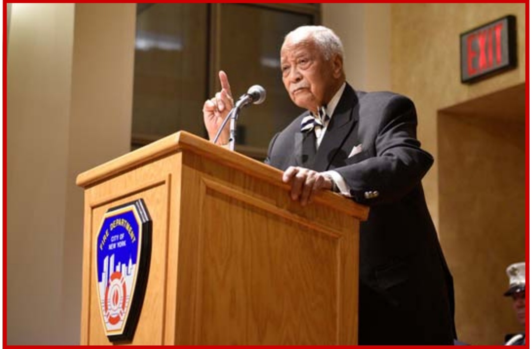
Former New York City Mayor David N. Dinkins served as a guest speaker during the celebration.

“When you ask whether or not Dr. King’s dream has been realized – no, it has not. Things are not yet where they need to be – thank god they are not where they used to be,” said former New York City Mayor David N. Dinkins. The Department’s