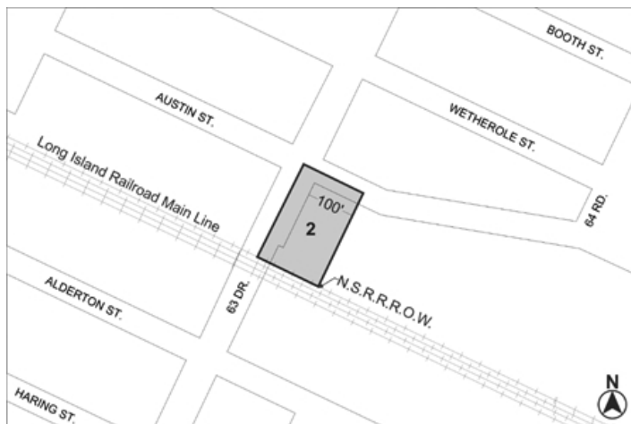
Mandatory Inclusionary Housing Area (see Section 23-154(d)(3))

Area 2 — [date of adoption] — MIH Program Option 1 and Option 2